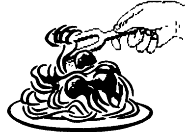
Enjoy spaghetti March 4 at LaRosa's & FMPA's "Musical Dinner Before the Show"